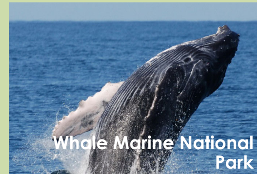
Whole Marine National Park