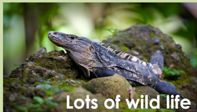
Lots of wild life