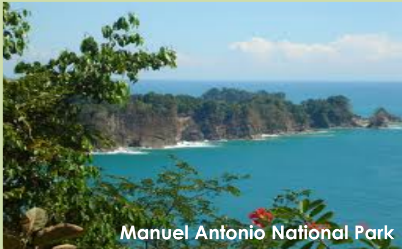
Manuel Antonio National Park